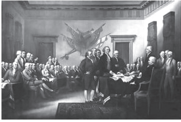
Artist: John Trumbull